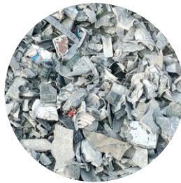
Aluminum: alloys separation