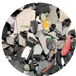
WEEE: Chlorine or brominated plastic removal