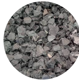
Glass: leaded glass removal