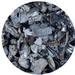
Zorba: aluminum cleaning (Twitch)